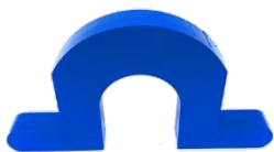
No-Tack Pad Example